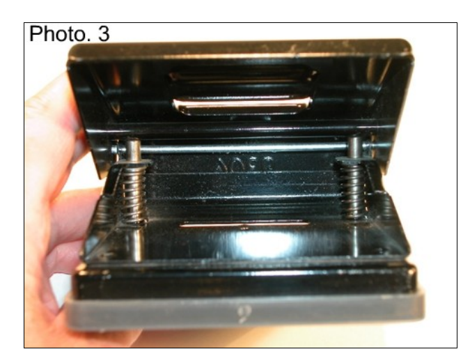
This view of the paper punch shows the punches, the springs and other components.