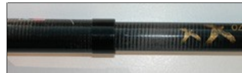
The tubes for this fishing rod were made by winding carbon fibres impregnated with resin onto a mandrel.

Hoop pattern , where the winding angle is just below 90 degrees. This method lays each hoop of fibre precisely next to the previous hoop (See photo of the fishing rod above)