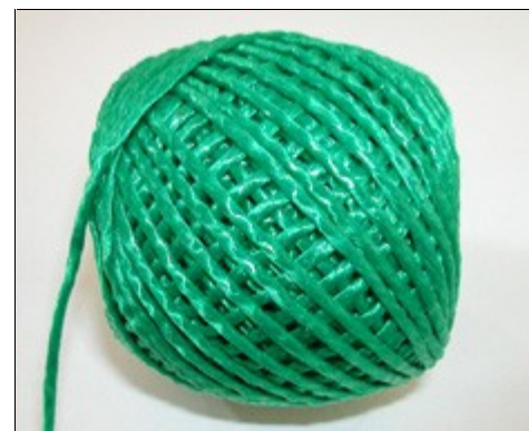
Filament winding, polar method

Polar method , where the winding method produces domed ends or spherical forms. (Similar to the ball of string opposite)